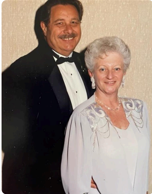
Mom and Dad 3/13/1993

Eileen Needle shared 4 photos to the Wylma Dorys Needle album. November 14 at 8:32 AM