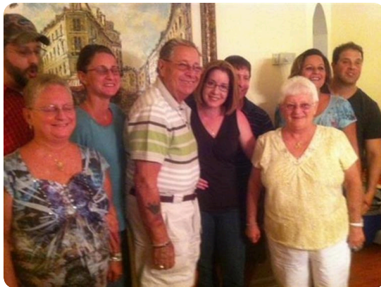
One of many family gatherings