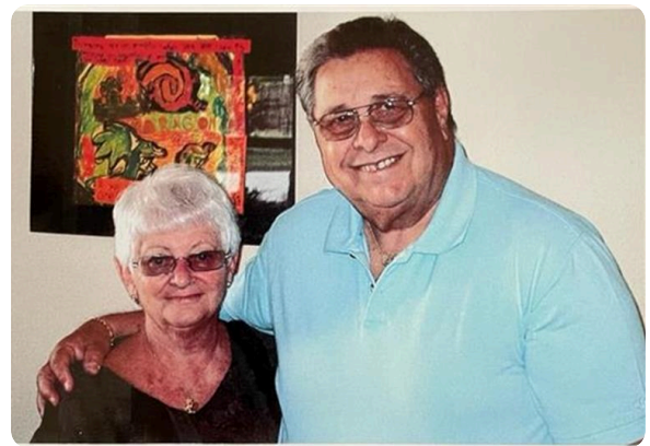
Mom and Dad