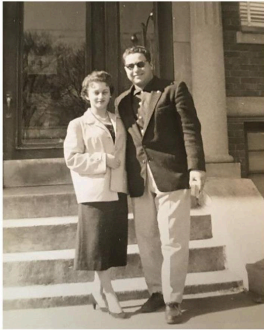
Mom and Dad